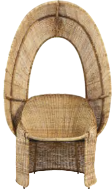
raw natural/black 00ACARCN-B